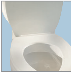
NO VISIBLE HARDWARE OR FASTENERS