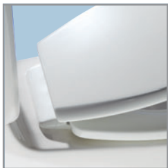
SECURE, STABLE MOUNT